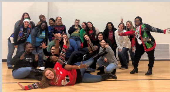
Children & Adolescents Team celebrated the holidays with team building and fun Christmas sweaters.