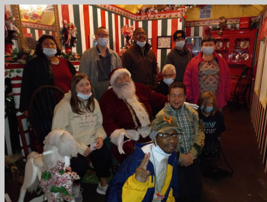
Concord Residential Home participated in a scavenger hunt at the Wonderland of Lights on December 15.