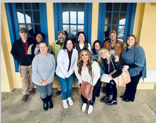
The ADRC/Housing/Veterans teams enjoyed a Christmas lunch at Papacitas.