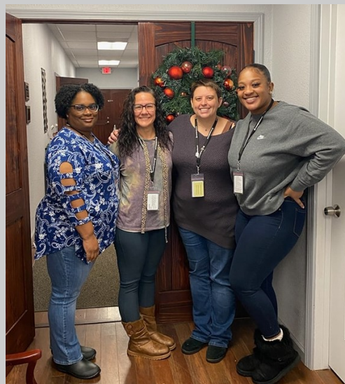
The Community Health Workers visited One Love Longview to share information about