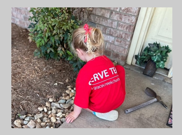
On September 17, Grace Creek Church hosted SERVE DAY in Longview. One of their many teams, served a Pegues Place for the day. The volunteers did landscaping and visited with the residents. Thank you, Grace Creek!

Learn More about Pegues Place: https://communityhealthcore.com/services/cypress-manor-and-pegues-place/