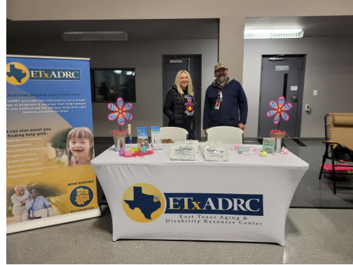
Ark Tex ADRC and East Texas Veterans Resource Center attended the Atlanta Resource Fair on April 9.