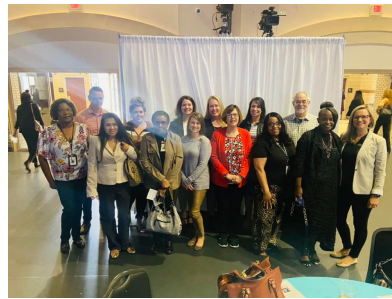
CHC staff attended the City of Longview, Unity Honors Luncheon on February 16.