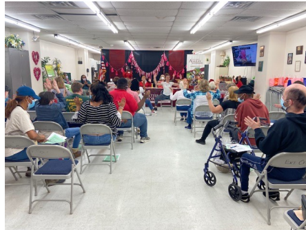
The day habs attended the Heart Healthy Seminar hosted by the Harrison County Extension Office and Texas Council for Developmental Disabilities on February 22. The attendees are doing chair exercises in this picture.