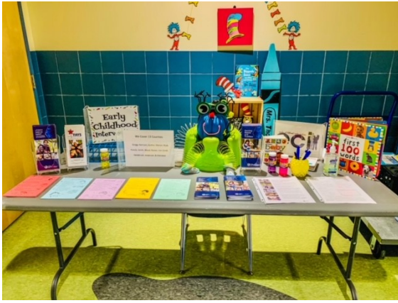
Early Childhood Intervention at Pine Tree Primary's Parent Connect event.